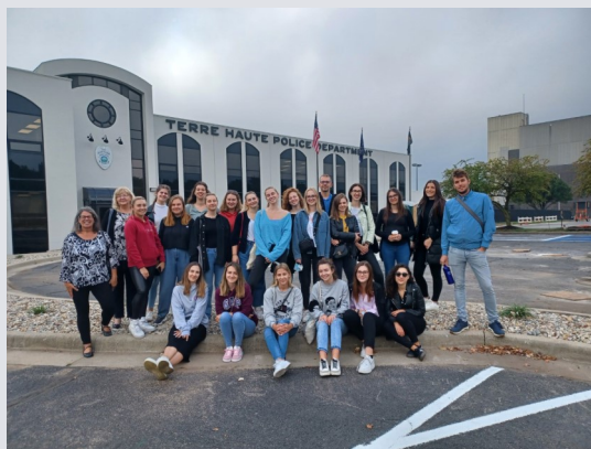
Left—University of Zagreb students and faculty toured the new Terre Huate Police Department.