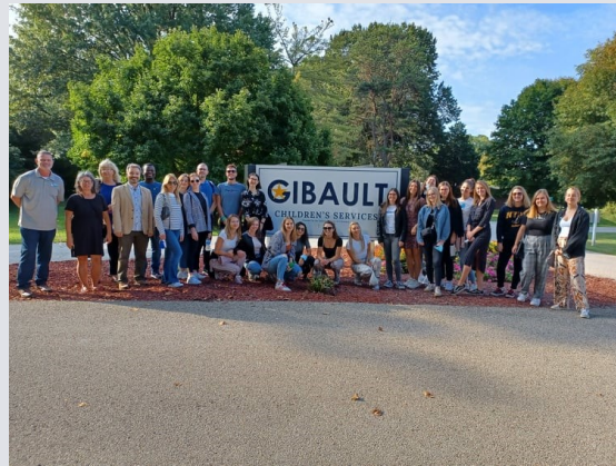
Right—University of Zagreb students visited the Giblout Children's Services in Terre Haute, Indiana.