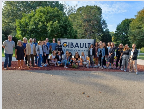
Right—University of Zagreb students visited the Giblout Children's Services in Terre Haute, Indiana.